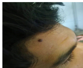
Fig-1: Before Treatment

With this case it can be concluded that Agnikarma can be done for the Mashaka a mole. It is effective procedure. There is no need of anesthesia. There is no chance of bleeding and reoccurrence as well. In the case, as there is no any scar left, it can be developed for cosmetic purposes also.