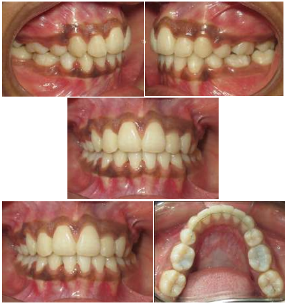
Fig. 10 Post treatment intra-oral photographs