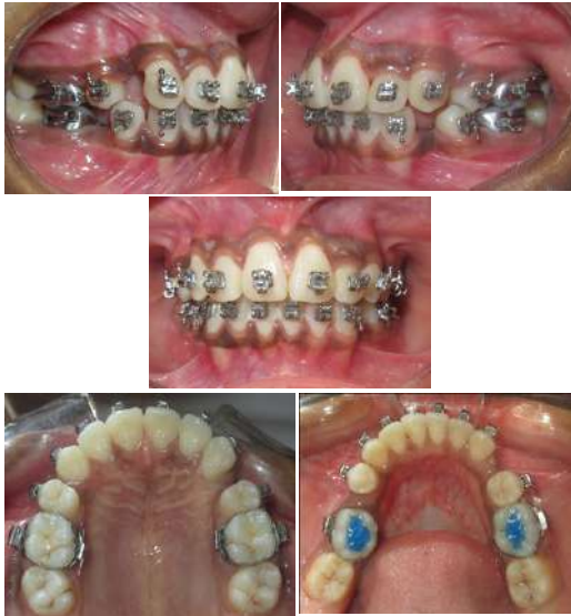
Fig.8 Alignment and leveling