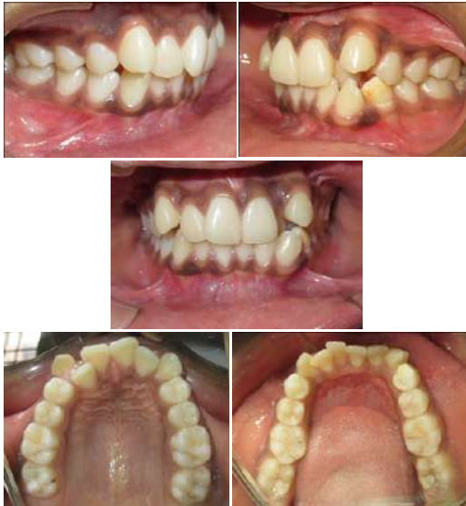
Fig.7 Pre treatment intra-oral photographs