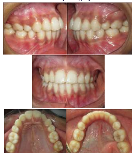
Fig. 5 Post treatment intra-oral photographs