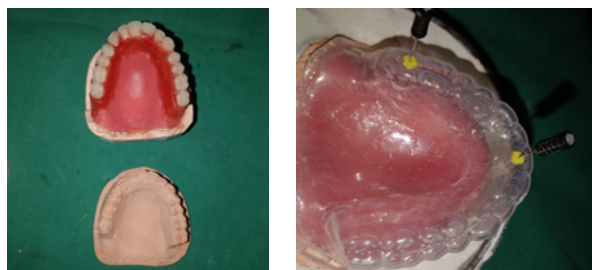
Fig 5 - Duplication of cast. Fig 6 - Space measured between matrix and base