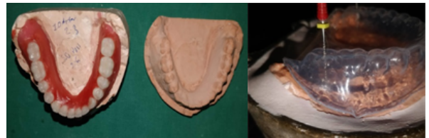
Fig 11 - Duplication of Mandibular cast. Fig 12 - Space measured with endodontic file