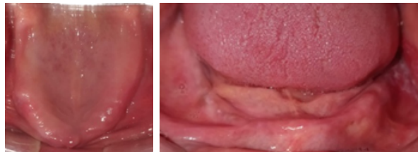
Fig 1 - Edentulous Maxillary ridge. Fig 2 - Edentulous Mandibular ridge

Any treatment extended to the patient should not only resolve the immediate problems faced by the patient, but also safeguard the future of the underlying tissues and surrounding structures. This case was treated prosthetically to meet the requirements of the patient and also to further prevent any detrimental effects. The salivary reservoir ensured lubrication of oral tissues to tackle the existing xerostomia, and ensure a successful prosthesis, and the hollow denture reduced stresses placed on residual ridges, which would aid in reducing the rate of resorption of residual ridges, hence nurturing the health of vital oral structures, and preserving them.