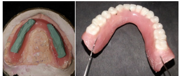
Fig 13 - Putty adapted on posterior 2/3 rd . Fig 14 - Salivary space verified with orthodontic wire.