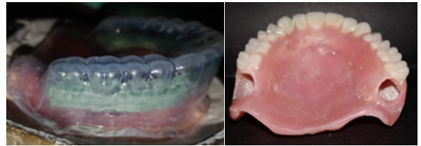
Fig 7 - Putty adapted on base. Fig 8 - Openings made to retrieve putty