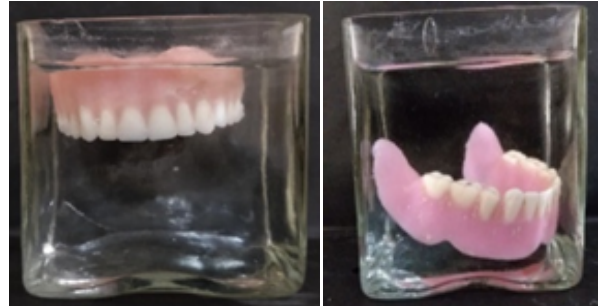
Fig 9 - hollow denture floats. Fig 10 - Conventional denture submerges