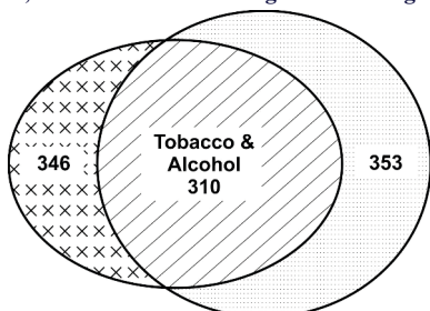
Fig. No.2 : Venn Diagram showing interaction between tobacco and alcohol addiction. Among the sailors 310 (66%) were at risk of addiction to both tobacco & alcohol.