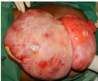
Figure 2: Large liposarcoma, arising from retroperitoneum and filling complete abdomen