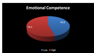
Figure 6: Graphical representation of the distribution of the subjects with high emotional competence and low emotional competence

Of the total 250 subjects in the sample, 115 are low in emotional competence and 135 were high in emotional competence. Figure 7 is a graphical representation of the same.