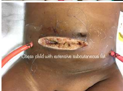
Obese child with extensive subcutaneous fat.