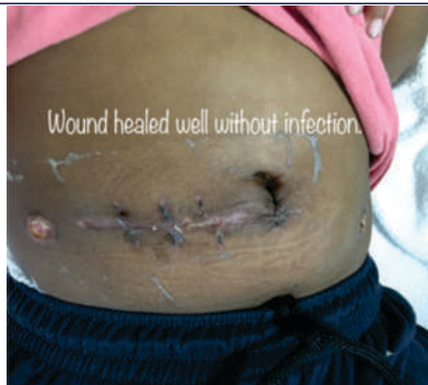
Wound healed well without infection.