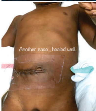
Another case , healed well.