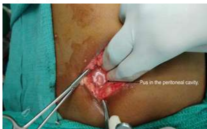
Pus in the peritoneal cavity.