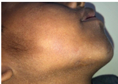
Figure 6: Post-operative photograph - lateral view

Clinical examinations showed no sensitivity to percussion or palpation and the soft-tissues were healthy and post-operative radiographs showed the progressive process of healing. [Figure 6]