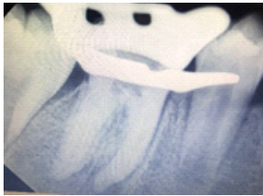
Figure 4: Radiograph showing triple antibiotic paste placed

BMP was performed with copious irrigation using 3% sodium hypochlorite (NaOCl) to remove the remaining necrotic pulp tissues. The canal is dried with paper points and triple antibiotic paste [Figure 4] was placed within the canals. Commercially prepared chemotherapeutic agents namely, ciprofloxacin (Cifran 500 mg, Ranbaxy Laboratories Ltd., India), Metronidazole (Metrogyl 400 mg, J.B. Chemicals and Pharmaceuticals Ltd., India) and Minocycline (Minoz 100 mg, Ranbaxy Laboratories Ltd., India) were used.