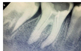
Figure 2: Radiograph showing incomplete obturation

carried out. After one month swelling along with pain was noticed on the right side of the face and later it subsided after taking medication. Again the same conditions occurred after 3 months. On intraoral examination swelling on the buccal side right permanent mandibular first molar caries on the distal side of first permanent premolar was seen. An intraoral periapical radiograph revealed associated periapical infection with incompletely filled canals in 36 [Figure 2]. Access opening was done on the same day and GP cones were taken out using H-files [Figure 3] followed by working length determination and intracanal medicament were placed.