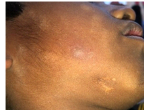
Figure 1: Extraoral pre-operative photograph - lateral view.

A 10-year-old patient reported to the Department of Pediatric and Preventive Dentistry, Inderprastha Dental College and Hospital, Sahibabad, with a chief complaint of extra oral swelling in the right submandibular posterior region of face [Figure 1]. Patient went to the local dentist and was given symptomatic treatment for the same and later root canal therapy was